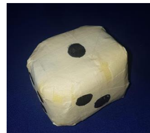
Dice made from Sponge.

This is a tad ambitious but look what can be achieved! Don't try this at home!