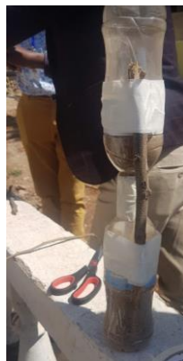
Egg timer made from bottles, twigs and dirt.