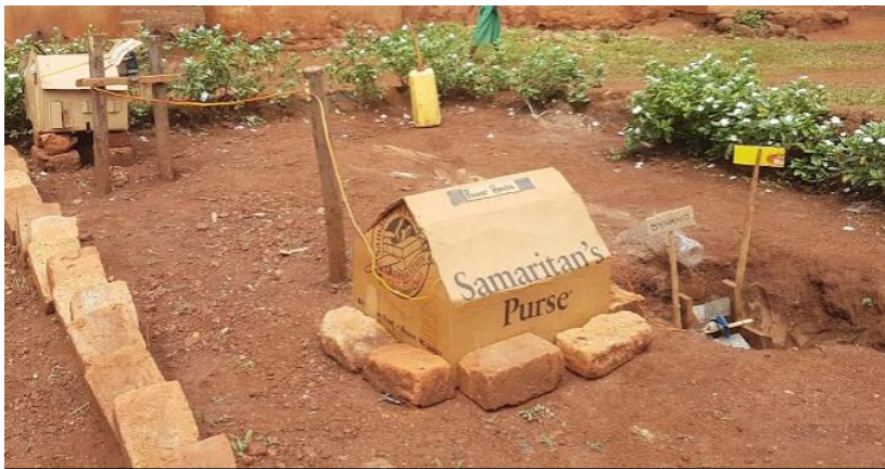
A hydro-electric system made from cardboard and batteries.

This is a tad ambitious but look what can be achieved! Don't try this at home!