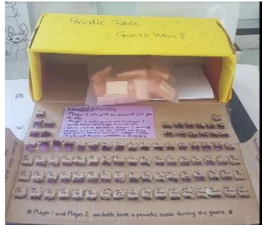
Periodic table made from an old shoe box.