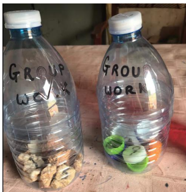
Group work points storage containers made from bottles.